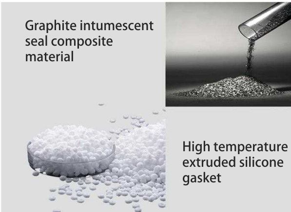
Graphite intumescent seal composite material

RSR/RPB can be used on fireproof doors where require both fire and smoke protection, it helps to slow the passage of smoke weather dust fire and heat.