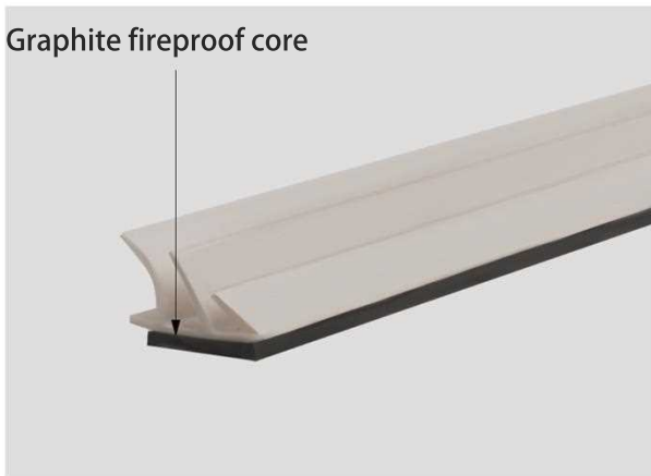
Graphite fireproof core

RSR/RPB can be used on fireproof doors where require both fire and smoke protection, it helps to slow the passage of smoke weather dust fire and heat.